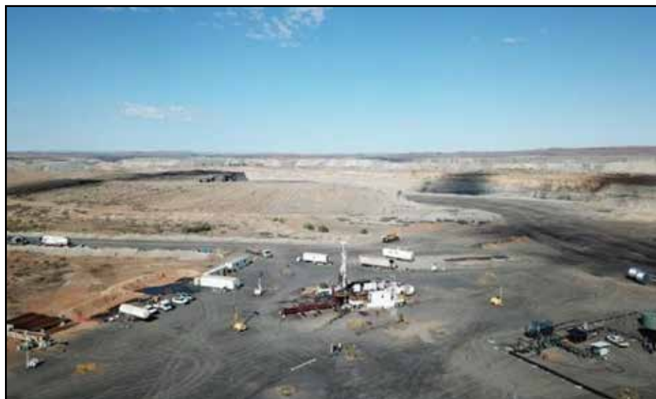
Leigh Creek Energy's underground coal gasification site, South Australia.

Leigh Creek Energy Ltd has provided data showing no environmental impacts at its pre-commercial in-situ gasification (ISG) demonstration facility in South Australia. Environmental monitoring data from the ISG operation at the former Leigh Creek coal