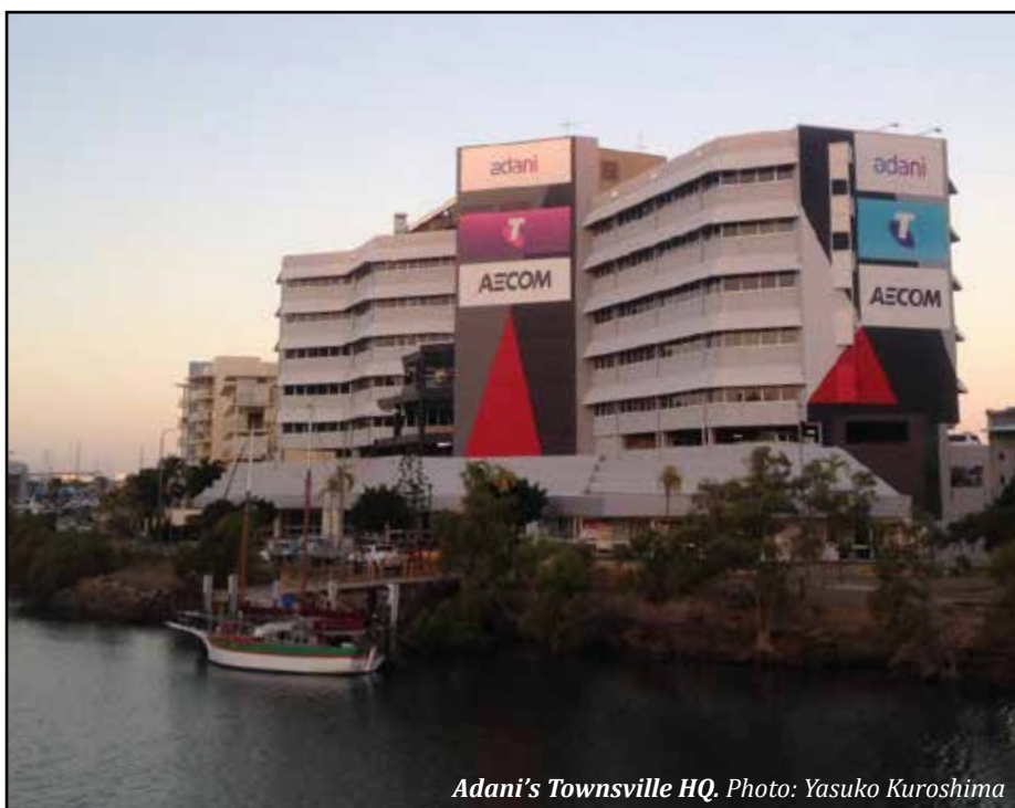
Adani's Townsville HQ.

"The Queensland Government has effectively set up a subsidised loan facil-