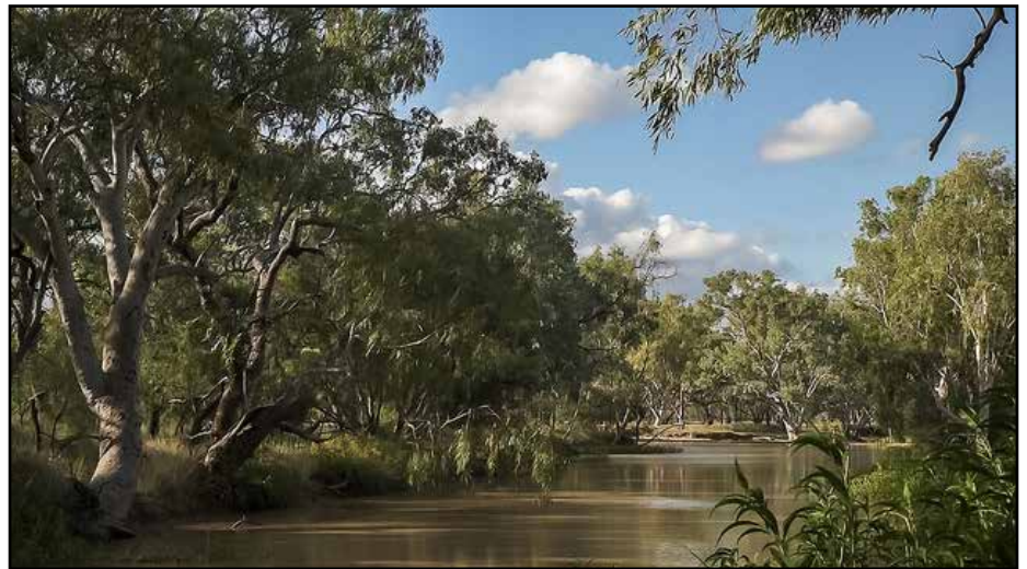
The Carmichael River is amongst water systems in over 14,000 square kilometres of land in the Galilee Basin that have more than a 95% chance of negative impact from planned coal and gas mines in the area.

“The assessment in predicted potentially widespread impacts to the nationally significant Doongmabulla